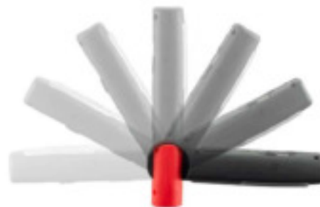
7 Position Pivoting Head Design 180°