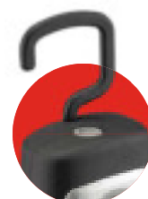
Swivel/Pivot Hanging Hook