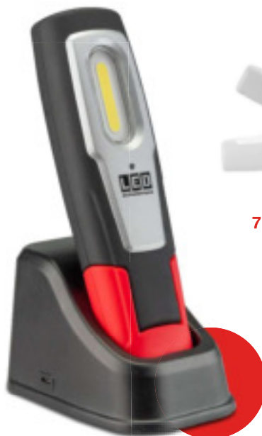
240V Recharge Dock HH190-1 only