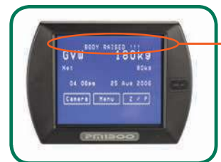
Body Raised Indicator