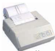
Heavy duty printer