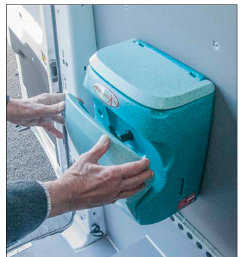
Liquid soap dispenser and paper towel holder available as extras.